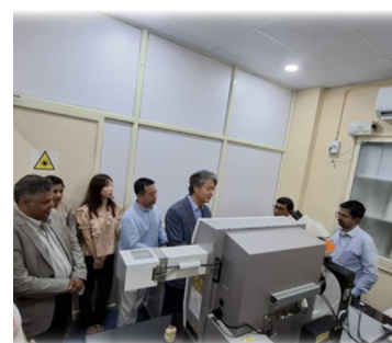
Dr. Raman Spec Opening Ceremony, Continued...

However, a major issue of Raman scattering is its inherently weak signal which led to a handful of improvisations over typical Raman spectroscopy out of which Surface Enhanced Raman Scattering (SERS) received huge acceptance allowing the ultrasensitive detection of analytes with low concentration through the amplified signals using gold nanoparticles. The potential of ultrasensitive SERS analysis in single living cells has been demonstrated using colloidal gold nano particles (AuNPs) deposited inside cells which resulted in strong enhancement of Raman signals of biomolecules opening up exciting opportunities for biomedical studies.